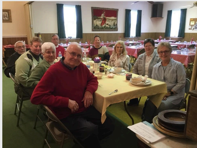
New Jersey chapter meeting

Though dispersed, we connect through chapters, associations, retreats, and online groups. Participate locally if possible and join OSL Facebook groups. Reflect on shared practices like praying the Daily Office.