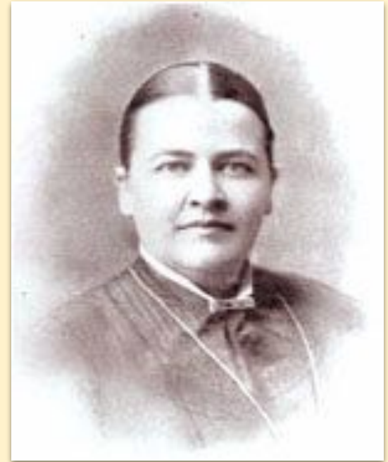
Laura Askew Haygood, April 29, 1900