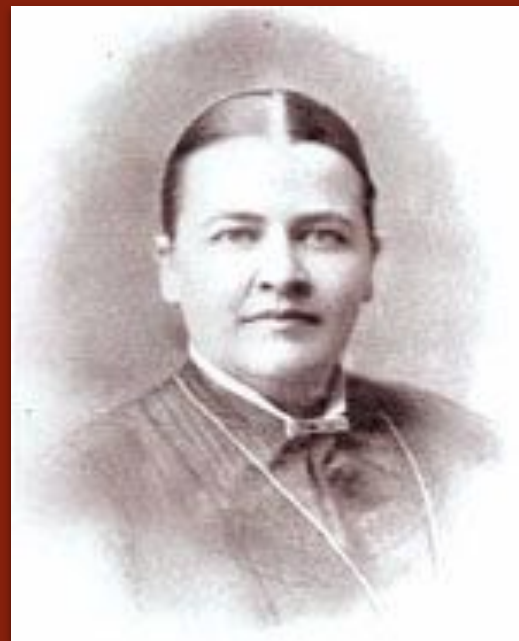
Laura Askew Haygood, April 29, 1900