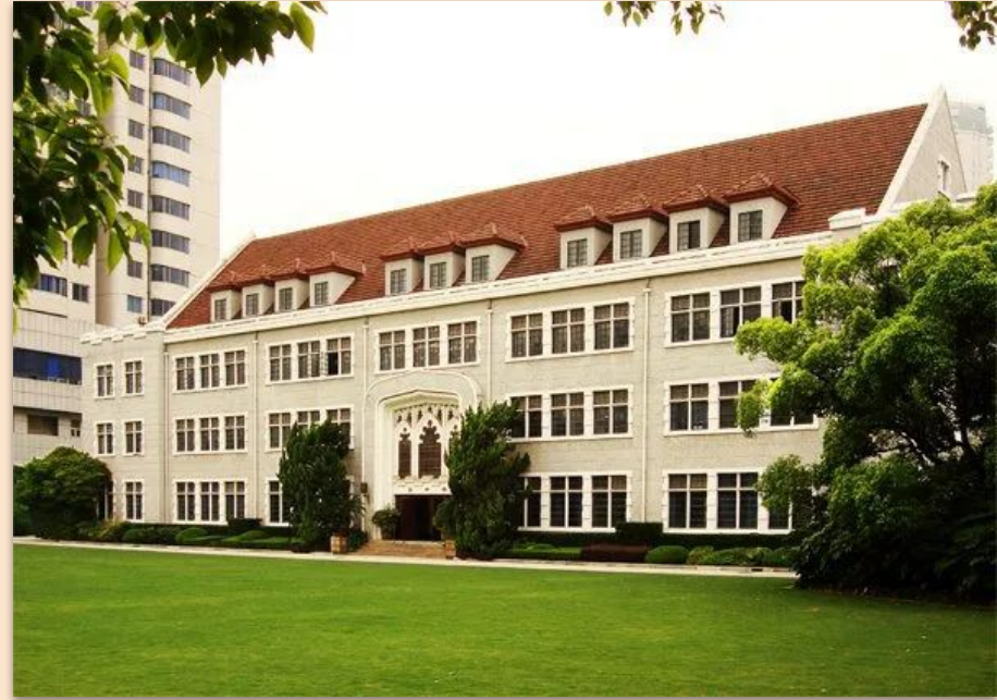
McTyeire School today in Shanghai

“Near the mighty Yangtze River, In the heart of old Shanghai, There’s a school for China’s daughters Bringing truth and freedom nigh. May she live and grow forever, Scatter knowledge far and near. Till all China learns the lessons That we learn at old McTyeire.”