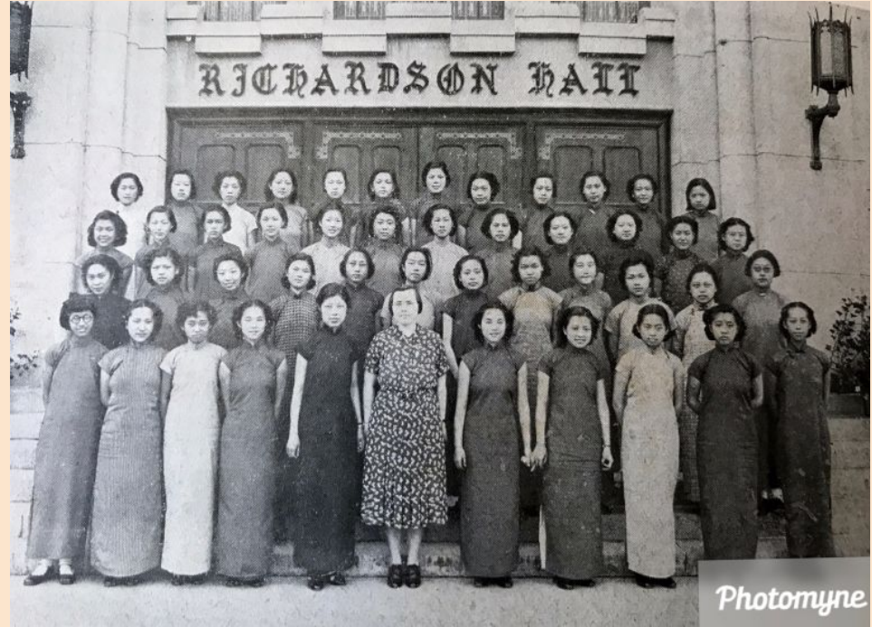
Students at McTyeire School

For the kin(g)dom, the power, and the glory are yours, now and forever. Amen.