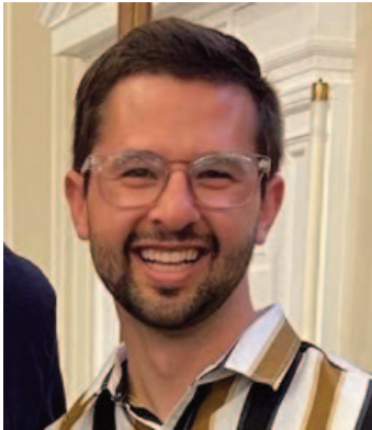
Hunter Bethea Asbury Seminary - Kentucky