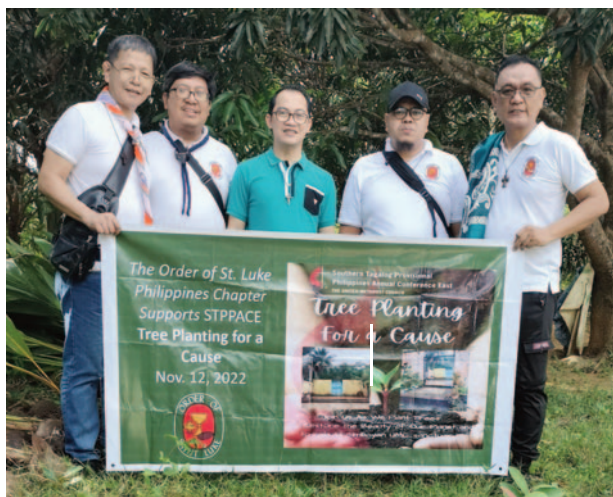
Sharing OSL support for the tree planting project with a banner.