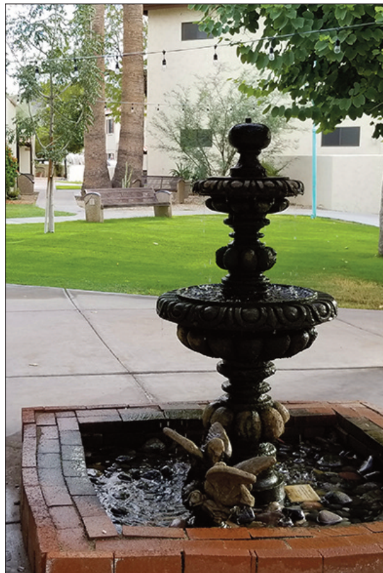
Holy Family and Fountain

We met in the Serra Room of Piper Hall. Outside the building, sculptures of the Holy Family provided a moment for meditation, while a bubbling fountain gave ample opportunities to remember our baptisms and be thankful.