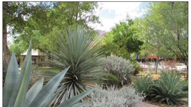
Desert plants commanded the outdoors.

Photos on this page by Br. French Ball, Br. Daniel Benedict and Br. Bob Schall