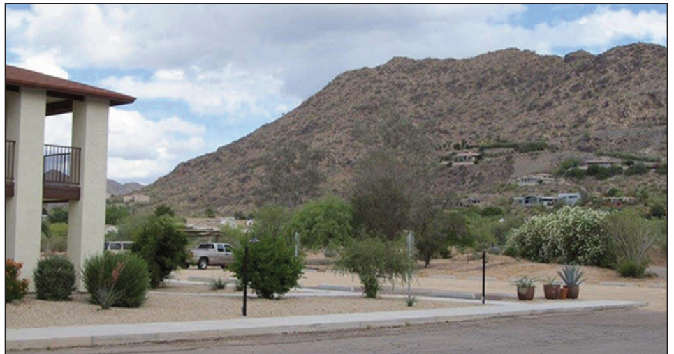
Mountains stood guard above the renewal center.