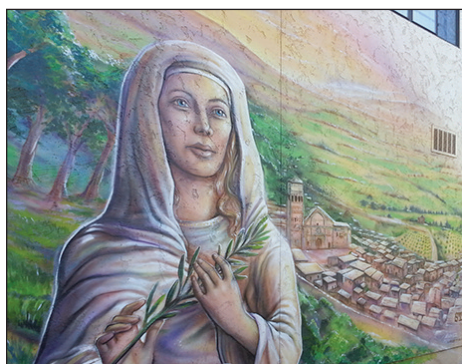
A mural of Saint Clare adorned an outside wall of one of the domiciles at the Franciscan Renewal Center where the Order of Saint Luke held its Retreat 2017.

Unless there are extenuating circumstances approved by the Abbot, the professing of life vows will take place at the Order's retreat or convocation.