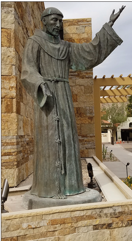
St. Francis of Assisi, our spiritual host.

God's glory was on display constantly, especially in glorious sunrises and sunsets like this one.